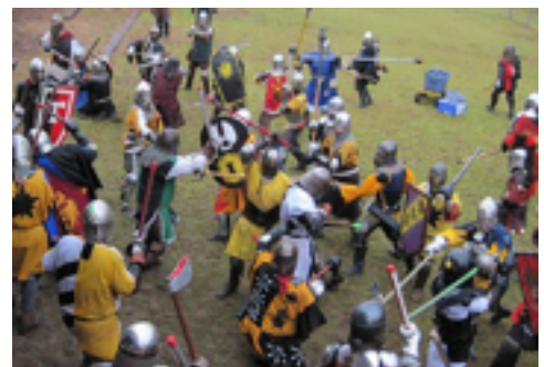
A disagreement erupted at last year's picnic. Supposedly it had something to do with the potato salad.

The Chapter will provide burgers, brats, buns, condiments, plates, silverware, napkins, beer, soft drinks and water. We are asking that attendees please bring a side dish or desert to complete the meal. Since we will be outside, kids and dogs are welcome, as are balls and frisbees. And let's all try to get along. We don't want another incident like The Great Potato Salad Melee .