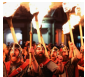
Some of the guys singing Ring of Fire at last year's party. Incidentally, the Cash Family dropped their suit.