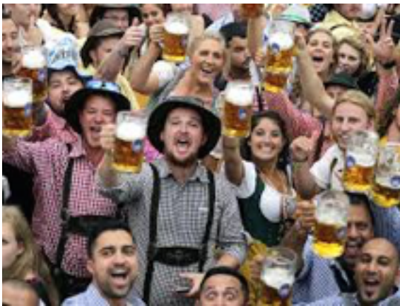
Some of the gang enjoying some cold ones at last year's party.