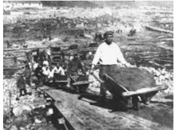
Members of last year's LRPP hard at work.

Reminder: Send your renewals to Chapter 29 and not SFA National, at Bragg.